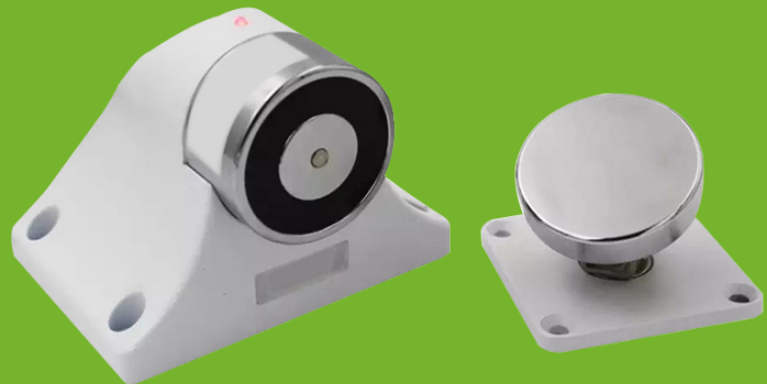
S4A-36B Signal feedback